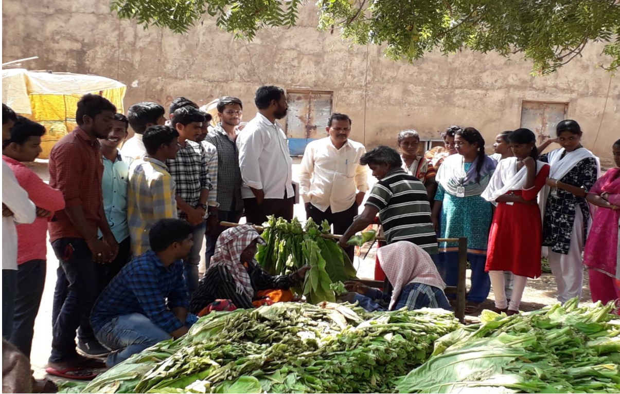
Filed Visit to Market Yard