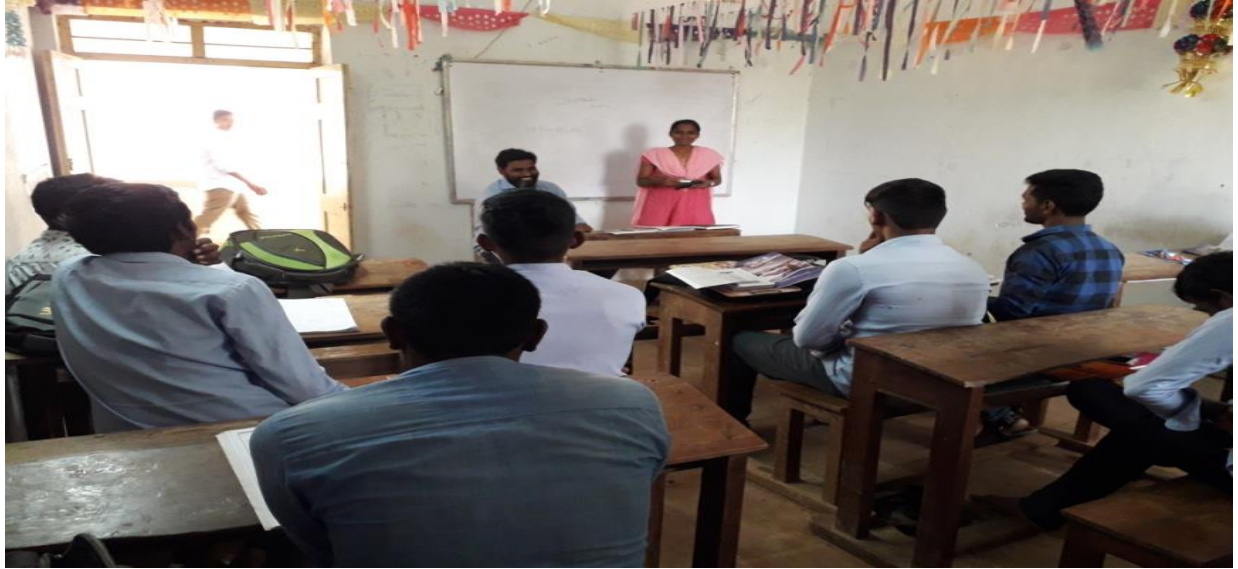
Research Paper Presentation in National Seminar